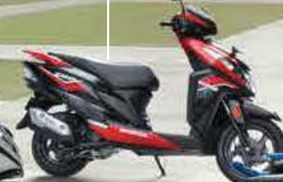
Mat Marvel Blue Metallic