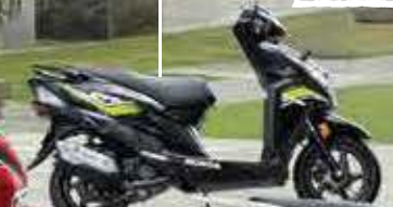
Pearl Deep Ground Gray